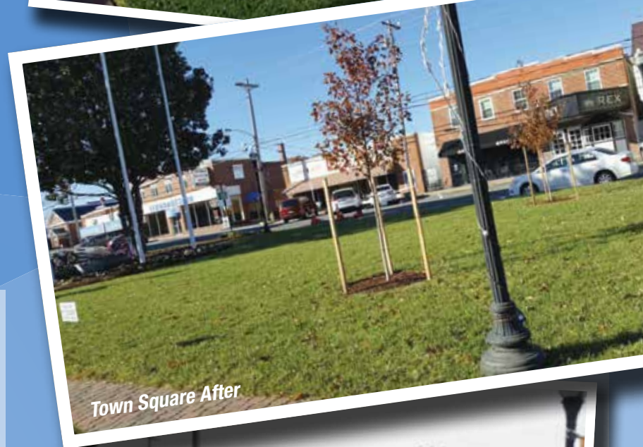
Town Square After