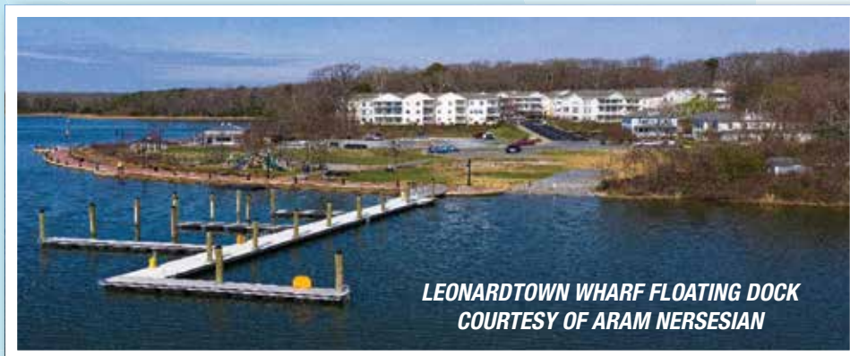
LEONARDTOWN WHARF FLOATING DOCK