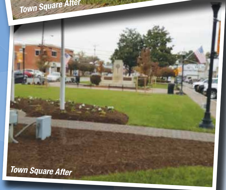
Town Square After