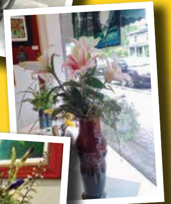
BEST BUDS ENTRIES