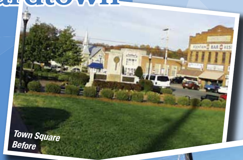
Town Square Before

Even with this short detour caused by the Coronavirus, Leonardtown is at an exciting cross road and thanks to great residents and local businesses we will be back stronger than ever.