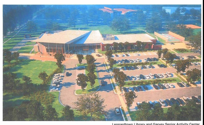
Leonardtown Library and Garvey Senior Activity Center