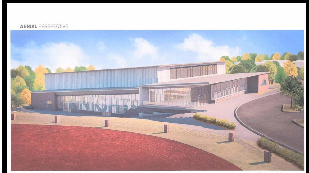
hord | coplan | macht