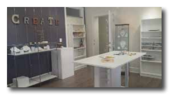
Patina + Stone Studio

The St. Mary's County Arts Council office is located at 22660 Washington St. (first floor of the Leonardtown Arts Center), open hours are 11-4 Tuesday thru Saturday, open Sundays on a seasonal basis and for extended hours for special events. Consider joining as a member at only $25 a year tax deductible donation to support the Arts! Other levels of membership are also available at family, business, and corporate levels. Contact (240)309-4061 or <a href="mailto:info@smcart.org">info@smcart.org</a> for details about our upcoming events or visit <a href="www.stmarysartscouncil.com">www.stmarysartscouncil.com</a>. Follow us on Facebook, Instagram, and Twitter #smcartscouncil